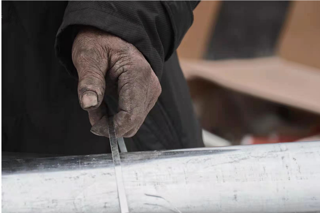
Extreme Close Up