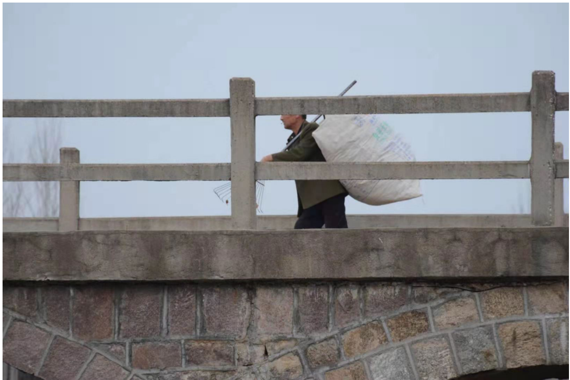
Limited Space, Flat Space