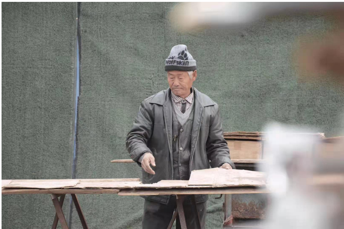
Medium Long Shot, Straight-On