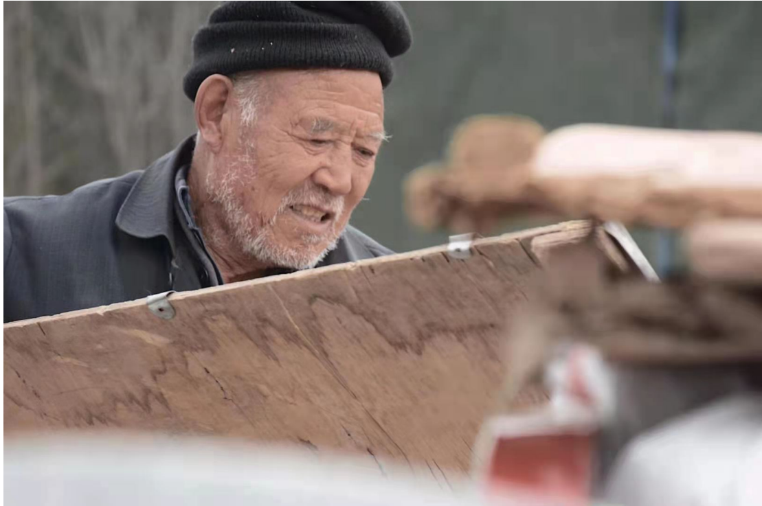
Medium Close Up